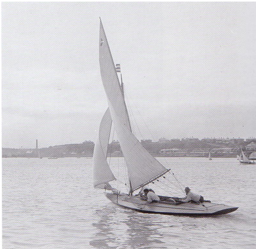
Mercia leading past Devonport in the first race of the Inter-Colonial One Rater Regatta 28 December 1898.